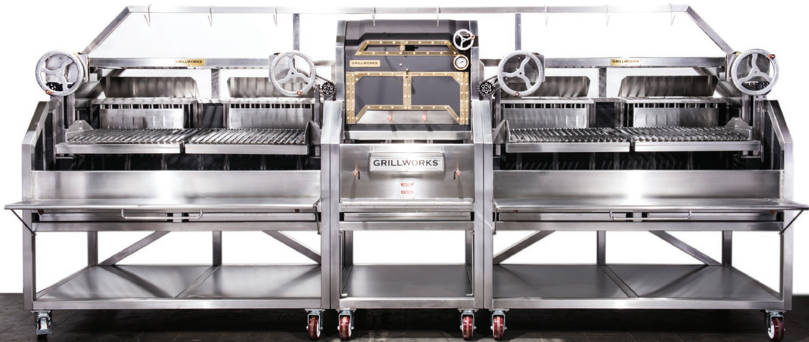
The Grillworks Inferno™ X166 166" wide, 40" deep, 72" high as shown